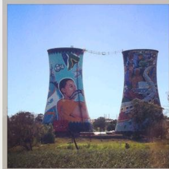
— Amazing use of space for art in Soweto

One of my favourite cities for Street Art is Berlin. This is a city rich with art and it has a long history of expressing itself through art – just look at the East Side Gallery – the remnants of the Berlin Wall. It is showcase of politics, oppression, freedom and culture. Its one of my favourite galleries. But along with the wall, the streets and buildings of Berlin are littered with graffiti and art all showing different thoughts and feelings.