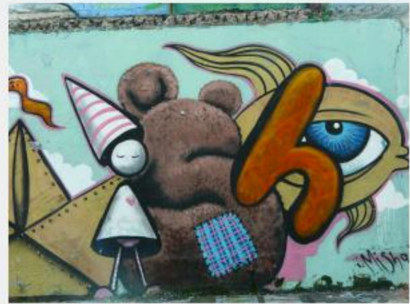
— Some of the many pieces of street art from San Jose