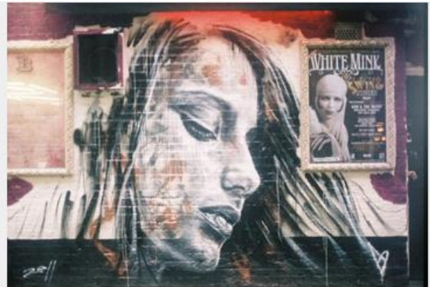
— Shoreditch Street Art

More recently I have been introduced to an art project in Cuba Fusterlandia , created by Jose Fuster, known as the Picasso of the Caribbean . As you enter the Havana suburb you are met by block after block of mosaic creations. It's a suburb that has been turned into a living art project and encourages the inhabitants to express themselves through their houses, gates and gardens! This is definitely something that I am very excited to explore when I go to Cuba in January!