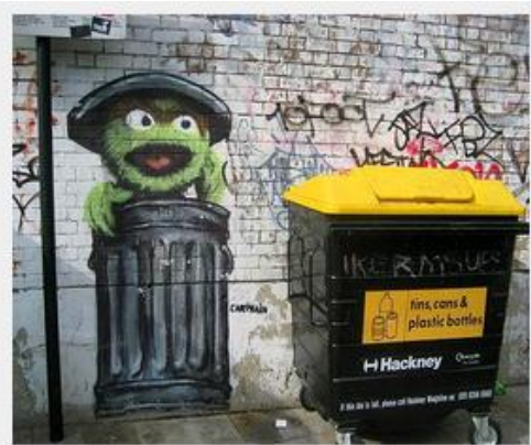
— Shoreditch art

Here in London of course we are spoilt... yes I am not going to deny it most of the graffiti out there is just tagging and pretty non descript but then you go to somewhere like Shoreditch which is starting to become like a living art gallery, around every corner is an artistic surprise, big and small. I follow quite a few people on Instagram but I particularly like following Anissa Helou as she is always putting up new pieces she finds wandering around Shoreditch – I can admire the art wherever I am thanks to her pictures! The art has become so popular that tours are popping up to show it all off.